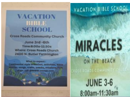
Farmington Cross Roads Community